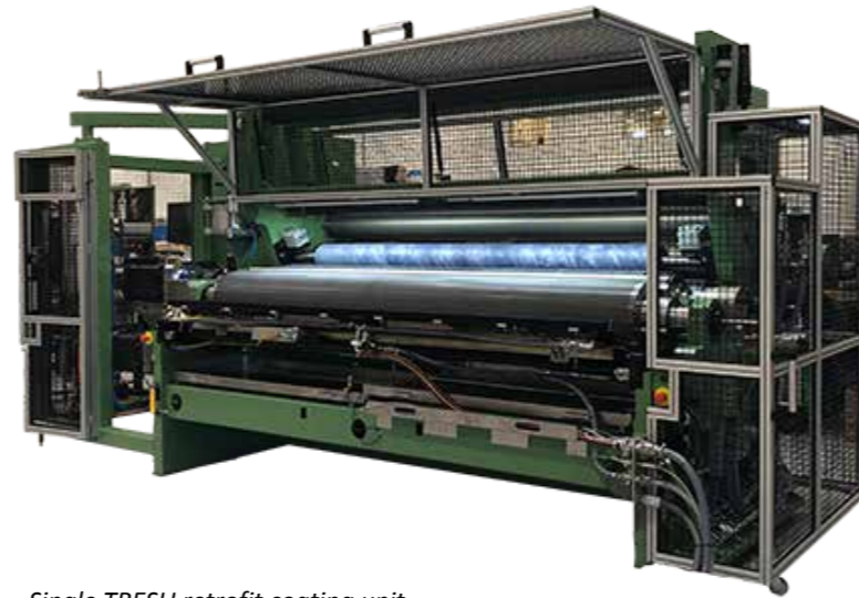
Single TRESU retrofit coating unit