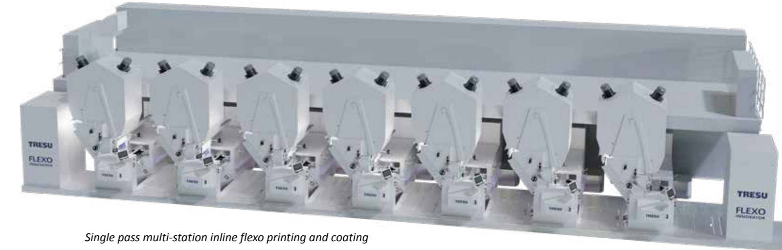
Single pass multi-station inline flexo printing and coating