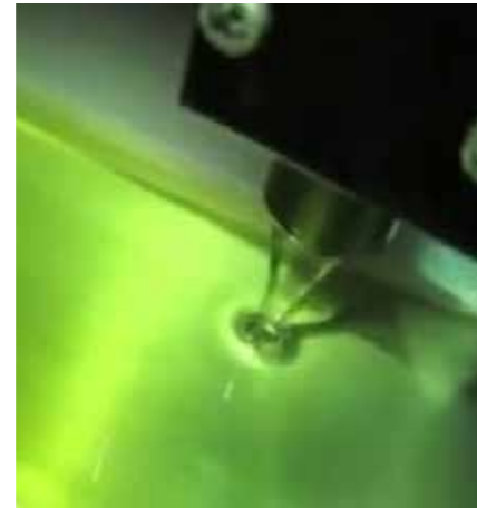
No air, no micro-foaming with TRESU automated pressure control technology.