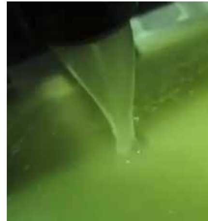
Air and micro-foaming without pressure control.

TRESU customers are successfully switching to pressure mode. By maintaining a constant, high pressure in the chamber doctor blade systems, then a liquid barrier forms between the rotating anilox cells and the chamber, stopping any air in the cells from transferring to the coating during production.