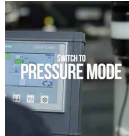
Switch to pressure mode at the push of a button.