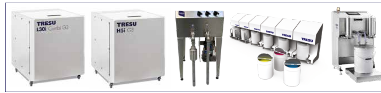
TRESU ink and coating supply systems