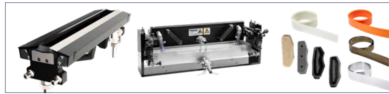
TRESU chamber doctor blade systems and proven doctor blades