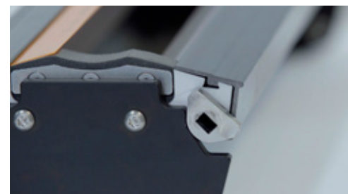
TRESU Chamber Quick Clamping System