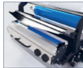
Removal in few seconds