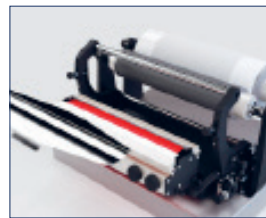
Quick change of chamber