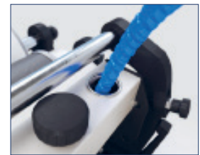
Manual filling and refilling or connection to an ink pump