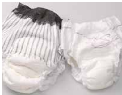
Adult diapers for men and women